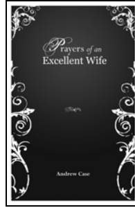
Prayers of an Excellent Wife

These books do not exist to make money. They exist to edify the Church, spread and deepen a passion for Scripture, and adorn the Gospel. This is why we offer them for free online and sell them for as little as possible. If anyone simply cannot afford to pay for these books, there is a Whatever-You-Can-Afford policy. We will accept whatever you're able to pay—even if it's nothing. It is our joy and delight to give freely what has been freely given to us (Matthew 10:8). We never want to make cost “an obstacle in the way of the gospel of Christ” (I Corinthians 9:12). So if you'd like a copy of a book, but your limited cash-flow prevents it, don't be ashamed! Just contact us and let us know what you'd like, and it will be our pleasure to fill your request.