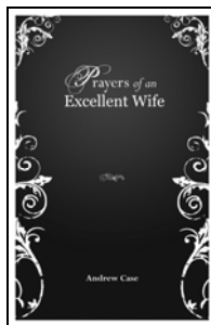
Prayers of an Excellent Wife

These books do not exist to make money. They exist to edify the Church, spread and deepen a passion for Scripture, and adorn the Gospel. This is why we offer them for free online and sell them for as little as possible. If anyone simply cannot afford to pay for these books, there is a Whatever-You-Can-Afford policy. We will accept whatever you're able to pay—even if it's nothing. It is our joy and delight to give freely what has been freely given to us (Matthew 10:8). We never want to make cost “an obstacle in the way of the gospel of Christ” (I Corinthians 9:12). So if you'd like a copy of a book, but your limited cash-flow prevents it, don't be ashamed! Just contact us and let us know what you'd like, and it will be our pleasure to fill your request.